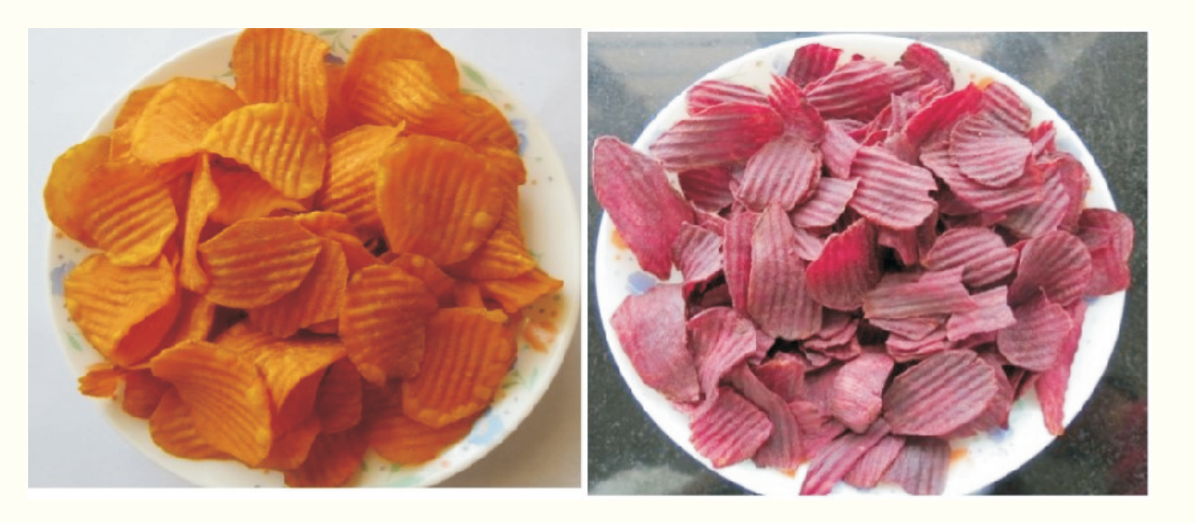
Fig. 3. a) Orange fleshed vacuum fried sweet potato chips rich in carotenoids b) Purple fleshed vacuum fried sweet potato chips rich in anthocyanin